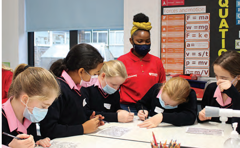
Newcastle University Street Science team demonstrate the values of water filtration