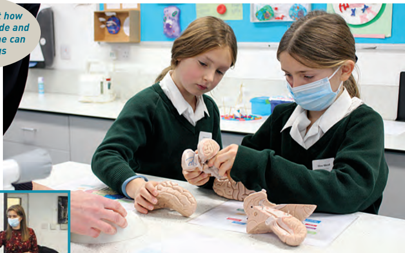
Girls from Mowden Hall learn how the brain works